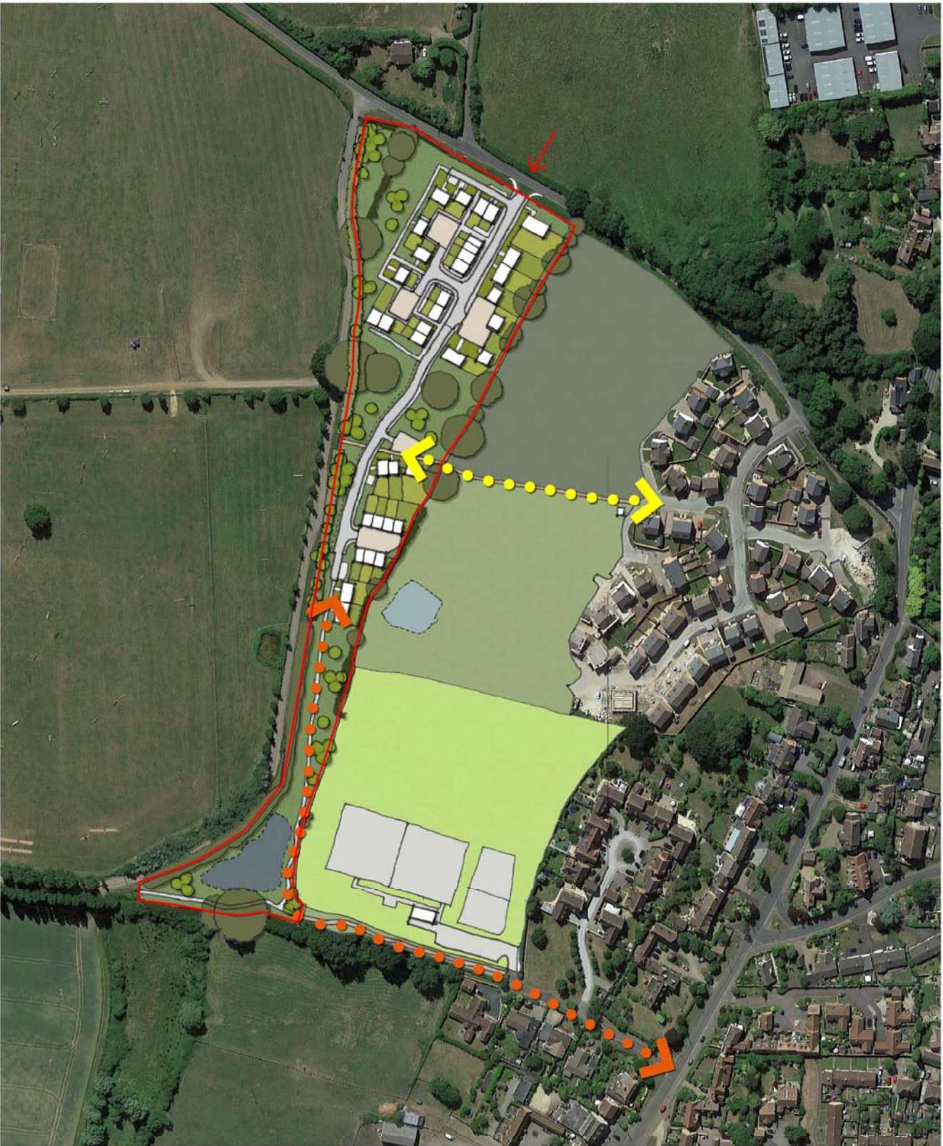
INDICATIVE SITE LAYOUT - PROPOSED LINKS

The scaling of this drawing cannot be assured Revision Date Dim Ckd 1