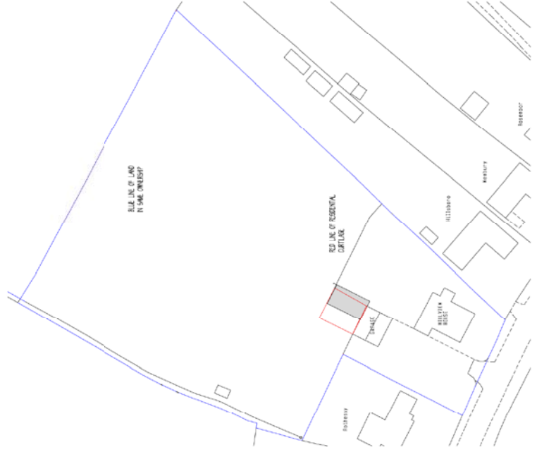
BLOCK PLAN - PROPOSED (1:500)